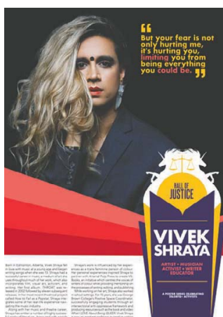
Vivek Shraya: Hall of Justice Winner

never felt like I was queer enough or trans enough," they say. "There's a lot of representation along the gender spectrum within the George Brown faculty, and they went above and beyond to make me feel comfortable."